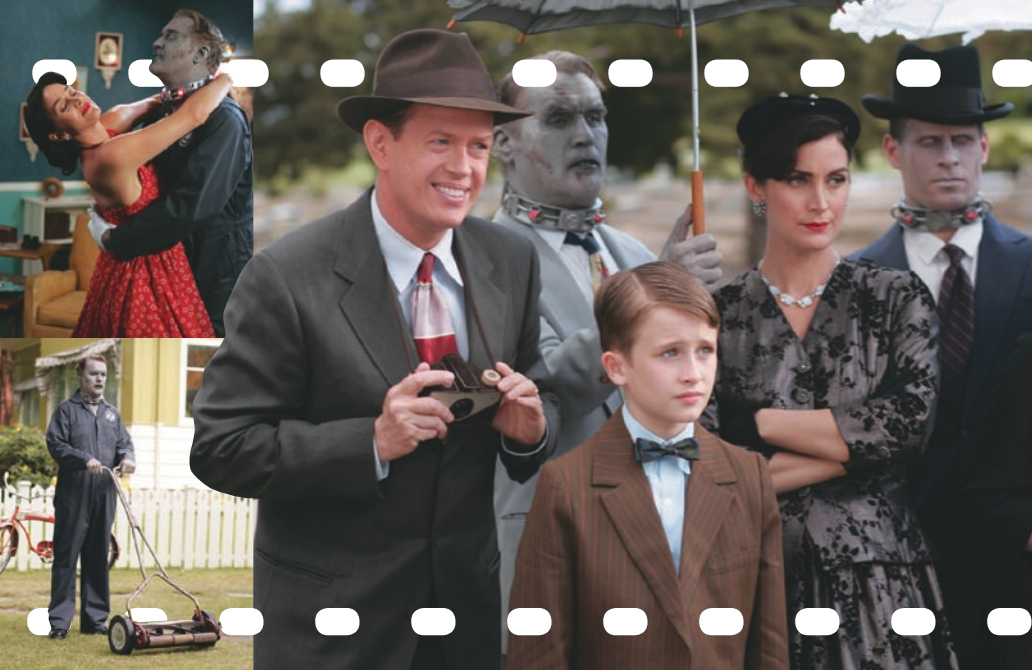
ZOMBIE ZANINESS (CLOCKWISE FROM TOP L): HELEN AND FIDO TRIP THE LIGHT FANTASTIC. THE FAMILY ENJOYS AN AFTERNOON OUTING TO THE CEMETERY. FIDO TAKES CARE OF THE YARD WORK