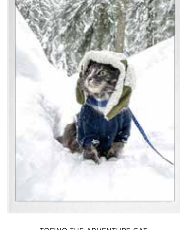
TOFINO THE ADVENTURE CAT

est," she says. "But if the cat is older, it's not impossible." The key is to combine training with something the cat enjoys, such as playing or eating a specific treat, and to try different harnesses until you find the perfect fit.