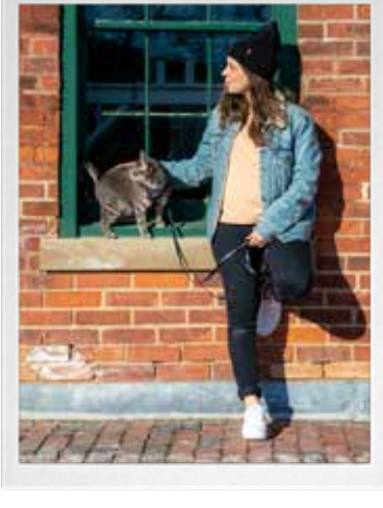
OLAF THE CAT