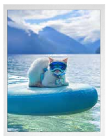
OLAF THE CAT