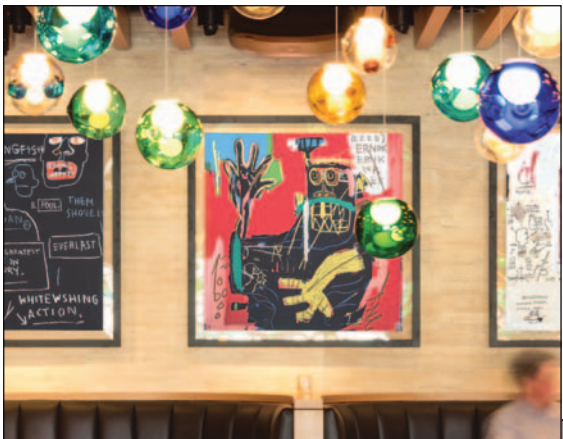
Jean-Michel Basquiat Rinso, Ernok and Per Capita Cactus Club Cafe, Richmond Centre Though he died at a tragically young age, the abstract artist produced hundreds of works in his 27 years.