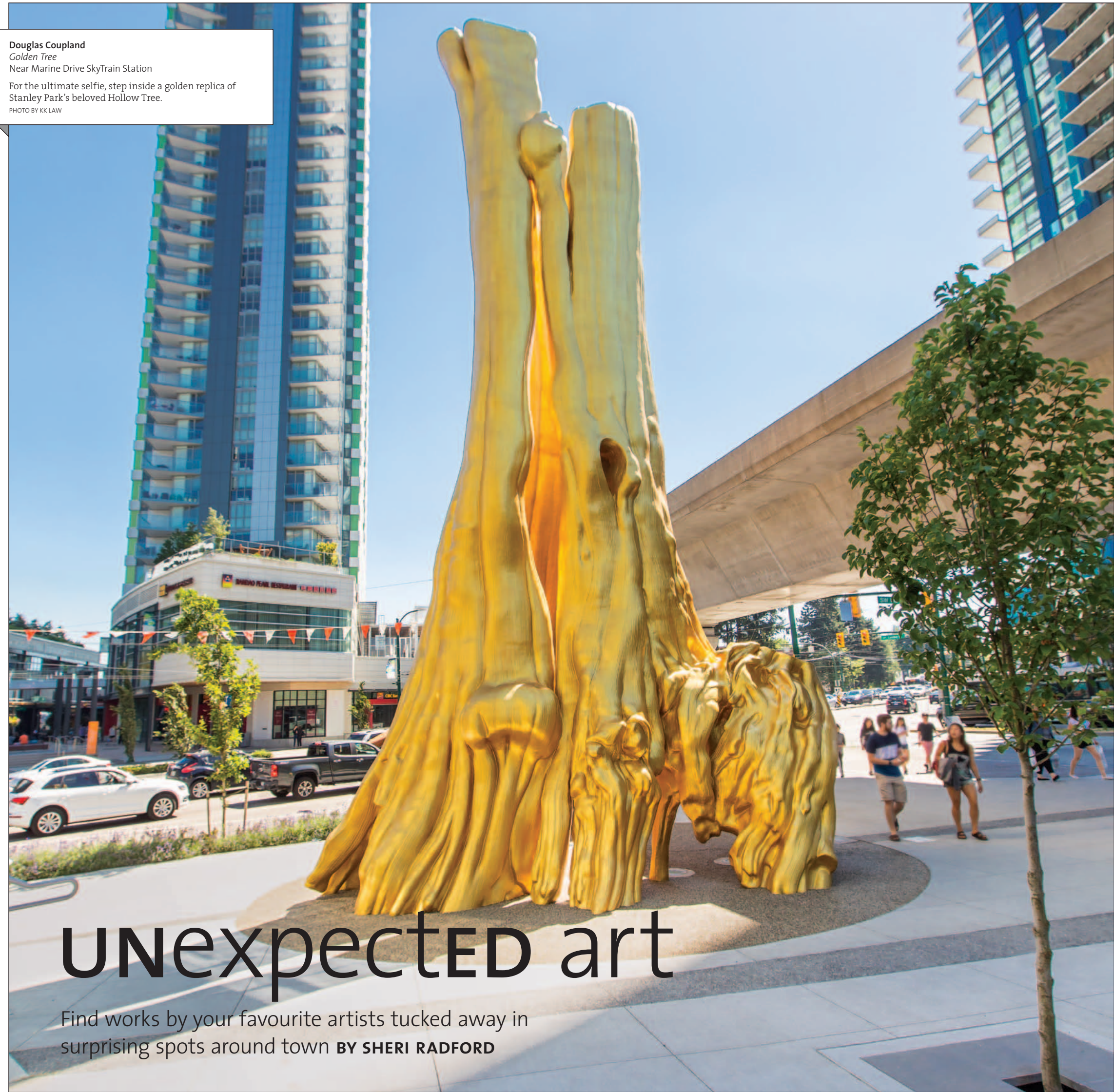
Douglas Coupland Golden Tree Near Marine Drive SkyTrain Station For the ultimate selfie, step inside a golden replica of Stanley Park's beloved Hollow Tree.