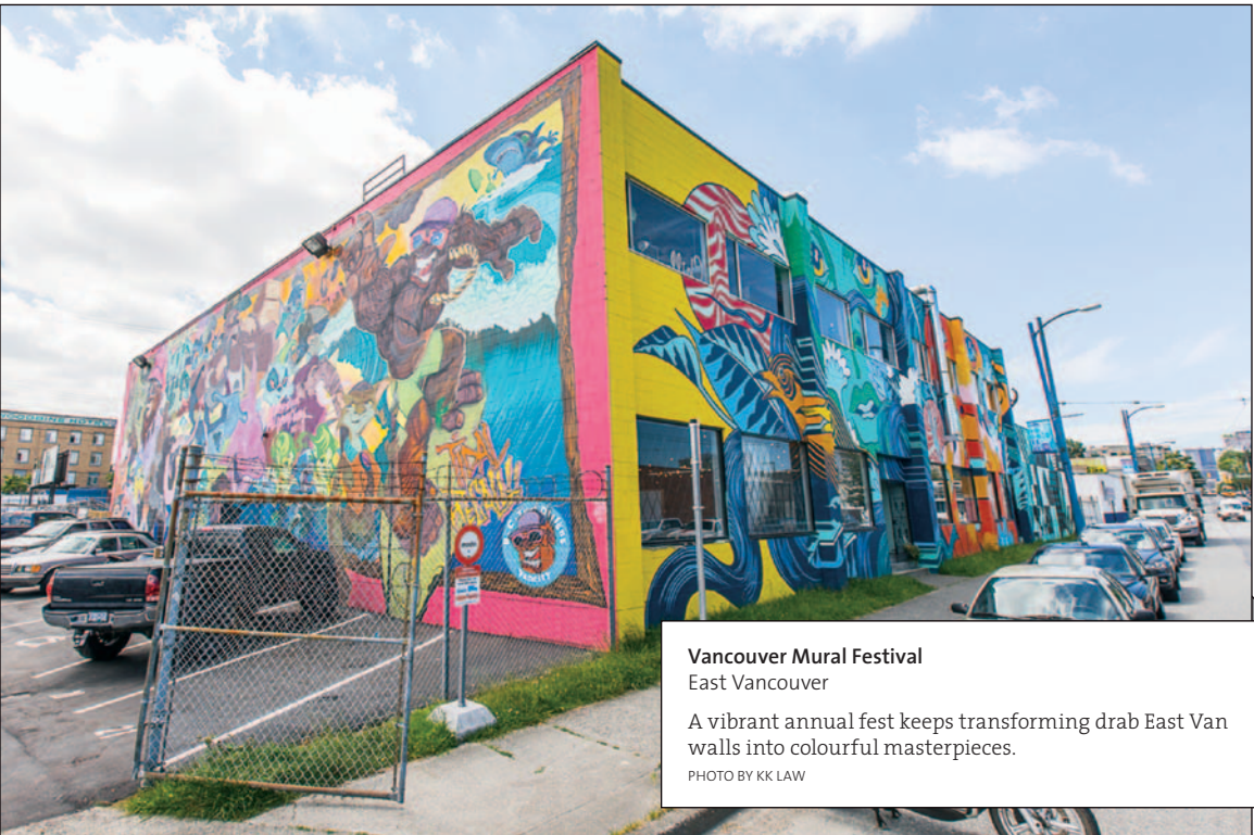
Vancouver Mural Festival East Vancouver A vibrant annual fest keeps transforming drab East Van walls into colourful masterpieces.

Find works by your favourite artists tucked away in surprising spots around town BY SHERI RADFORD