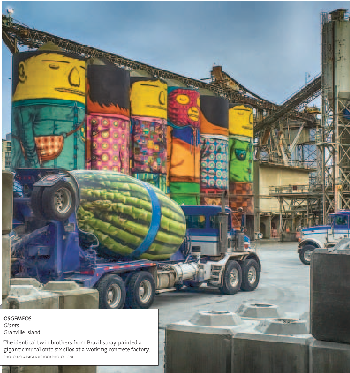
OSGEMEOS Giants Granville Island The identical twin brothers from Brazil spray-painted a gigantic mural onto six silos at a working concrete factory.