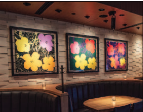
Andy Warhol Flowers #67, #65, #66 Cactus Club Cafe, Richmond Centre Each Cactus Club restaurant boasts an array of original pieces, including several by the superstar of pop art.