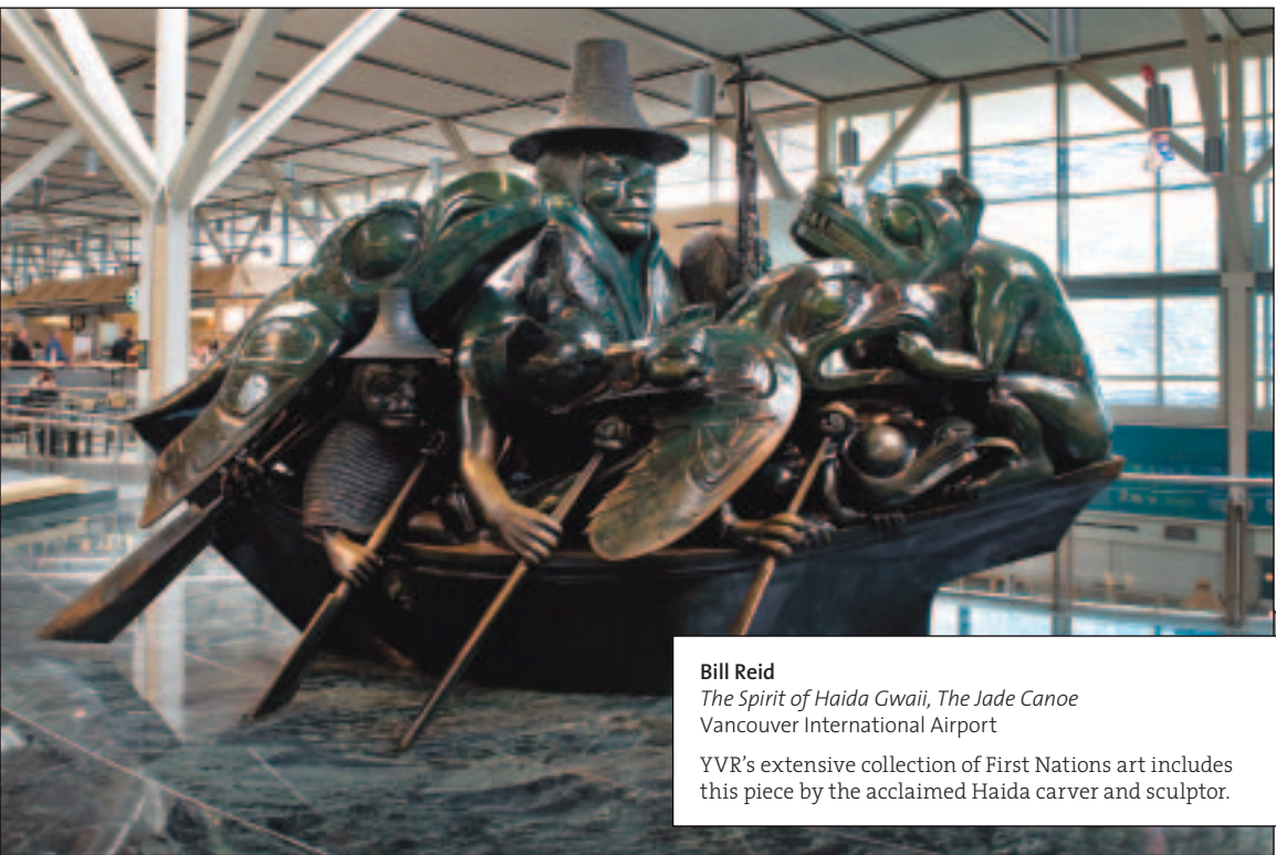
Bill Reid The Spirit of Haida Gwaii, The Jade Canoe Vancouver International Airport YVR's extensive collection of First Nations art includes this piece by the acclaimed Haida carver and sculptor.