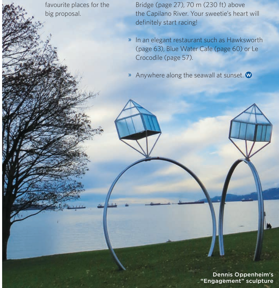
Dennis Oppenheim's "Engagement" sculpture