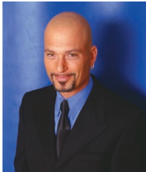
IT'S A DEAL: FUNNY MAN HOWIE MANDEL DOES STAND-UP