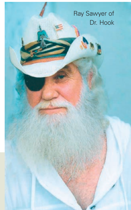
Ray Sawyer of Dr. Hook

17, 18, 20 to 22, River Rock Show Theatre; and Apr. 24 to 29, Red Robinson Show Theatre; page 77 ). In Stomp , the performers create compelling rhythms out of anything and everything, from lighters and brooms to plungers and hubcaps (Apr. 17 to 22, The Centre in Vancouver for Performing Arts; page 77 ).