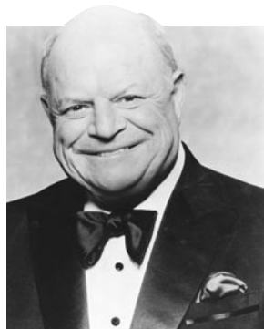
(L) YUK IT UP: DON RICKLES BRINGS ON THE LAUGHS. (R) MOVE IT: PERFORMERS IN STOMP MAKE RHYTHM HAPPEN