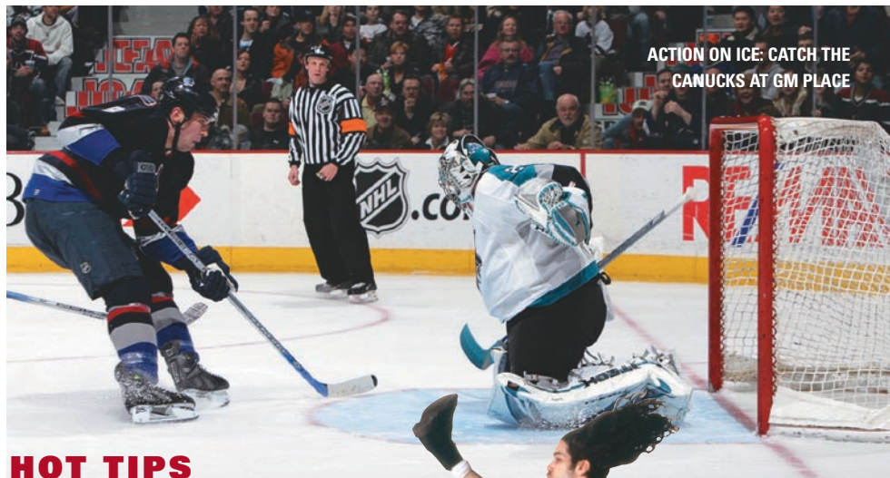
ACTION ON ICE: CATCH THE CANUCKS AT GM PLACE