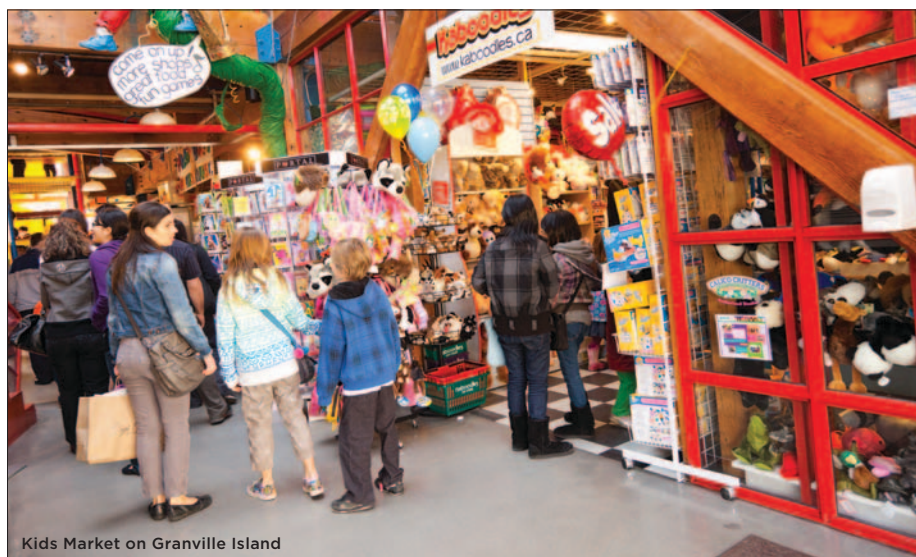
Kids Market on Granville Island