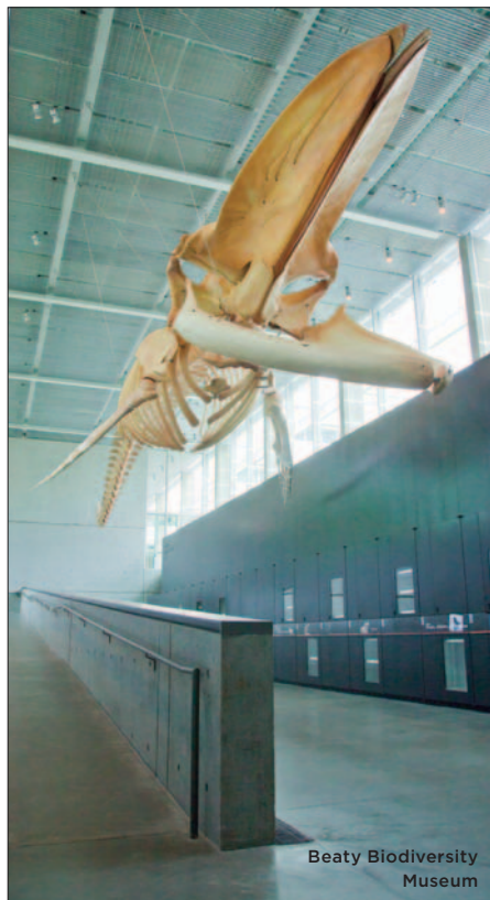
Beaty Biodiversity Museum