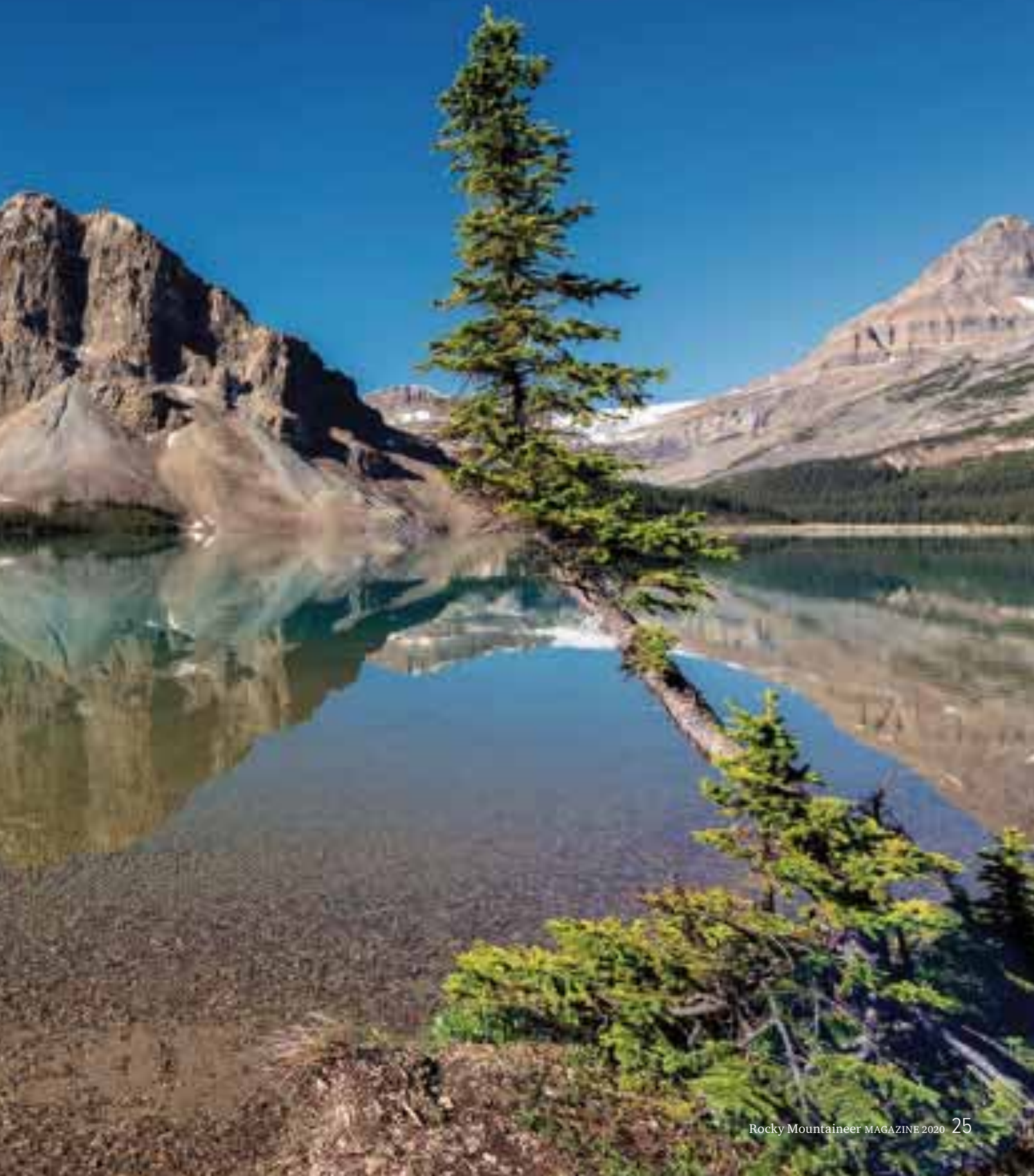
One of the largest lakes in Banff National Park, Bow Lake is fed by the Bow Glacier.