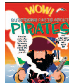
(Clockwise from above) Pirate Adventure Dice. I Wonder Why Pirates Wore Earrings . Wow! Surprising Facts About Pirates . Anchor pendant from Thomas Sabo. Skull t-shirt by Strellson. Pirate Magnetic Poetry Kit. Pirate shirt by Pineapple Pete Kids. Anchor ring by Lacar

Pineapple Pete Kids ( www.pineapplepete.ca ) and a Disney's Jake and the Never Land Pirates watch by Flik Flak (at Swatch The Store, page 30). Then keep the rapsallions and scallywags busy with Pirate Adventure Dice (at www.amazon.ca ), a sailing trip around False Creek with Pirate Adventures (page 69) or a visit to the Gulf of Georgia Cannery (page 68), which on Sep. 19 features a pirate-themed scavenger hunt with the grand prize of a chocolate treasure chest. Also popular with the 10-and-under crowd is a Pirate Pak meal from White Spot (page 80), served in a cardboard boat.