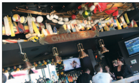
(Clockwise from bottom L) Tote bag from Make. Crystal Head Vodka. Disney's Jake and the Never Land Pirates watch and treasure chest by Flik Flak. Pirate Pak meal at White Spot. Nautical decor at Burrard Bridge Marine Bar & Grill