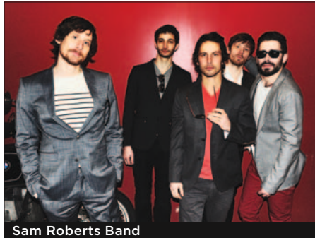
Sam Roberts Band