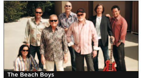
The Beach Boys

It all adds up to an unforgettable PNE experience.— Sheri Radford