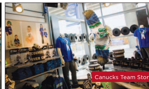
Canucks Team Store