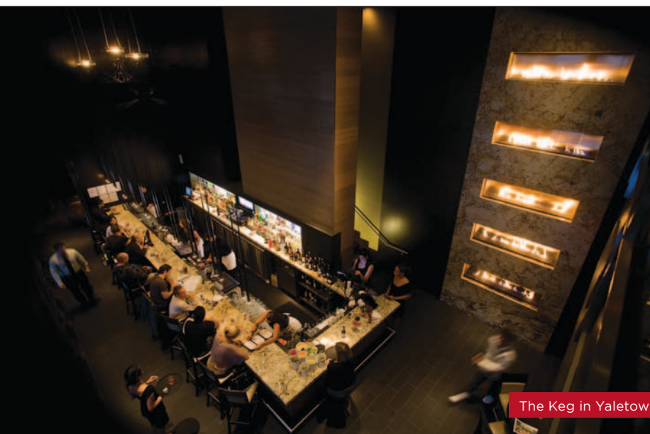
The Keg in Yaletown