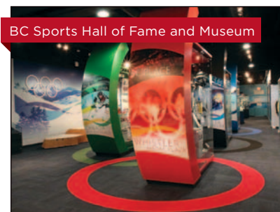
BC Sports Hall of Fame and Museum