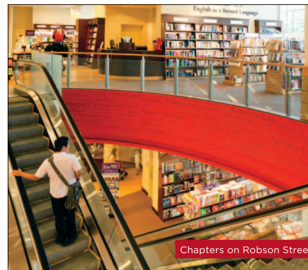
Chapters on Robson Street

Give your wallet a workout at Pacific Centre's (page 18) myriad stores, from high-end boutiques to budget-friendly chains, such as H&M (page 21), Apple (page 20), Sephora (page 18), Michael Kors (page 22) and Gap (page 21). The attached Holt Ren-