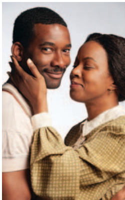
INTIMATE APPAREL

It's 1905, and plain, sensible, lonely Esther yearns for love. She sews custom lingerie for the uptown ladies of New York—for the downtown working ladies, too—all the while wishing she could wear one of her own exquisite creations. See playwright Lynn Nottage's exploration of race, class, identity and desire at the Granville Island Stage (to Mar. 10; page 51).