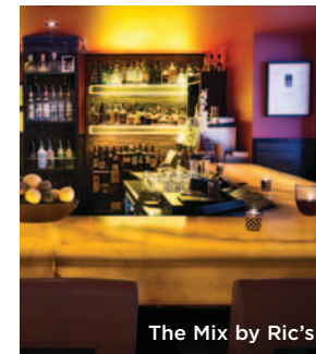
The Mix by Ric's