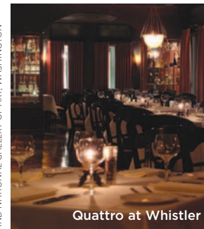
Quattro at Whistler