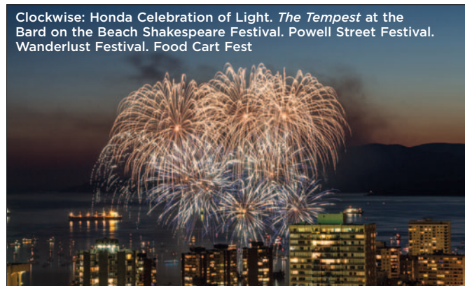
Clockwise: Honda Celebration of Light. The Tempest at the Bard on the Beach Shakespeare Festival. Powell Street Festival. Wanderlust Festival. Food Cart Fest