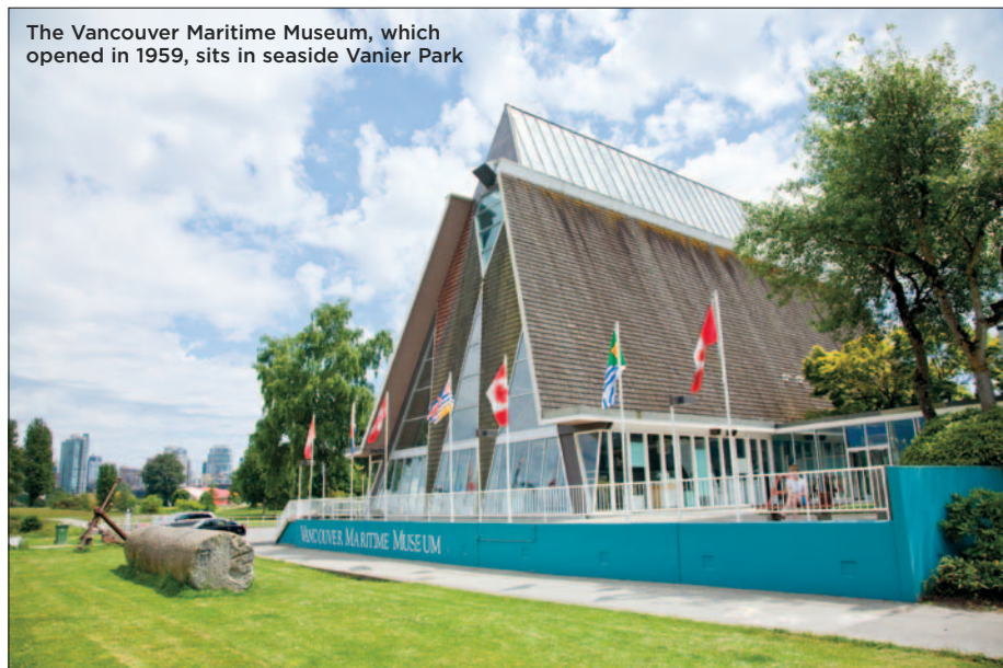
The Vancouver Maritime Museum, which opened in 1959, sits in seaside Vanier Park