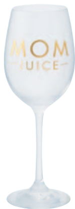
Mom Juice wine glass by Indigo (page 79)