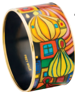
Hundertwasser-inspired 24K-gold-plated bangle by FREYWILLE (page 87)