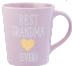
Best Grandma Ever mug by Indigo (page 79)