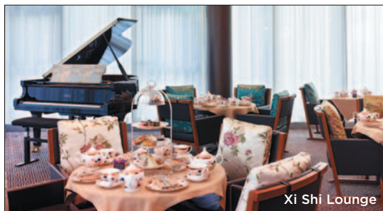
Xi Shi Lounge