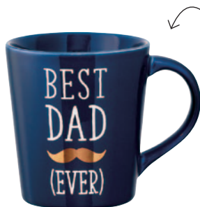
Best Dad Ever mug by Indigo (page 28)

Does your dear old dad really need one more silk tie? On Jun. 18, please your papa with one of these presents instead.— Sheri Radford