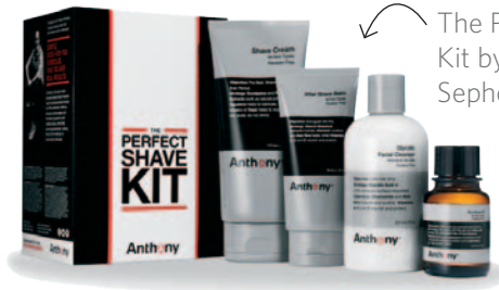
The Perfect Shave Kit by Anthony, at Sephora (page 41)