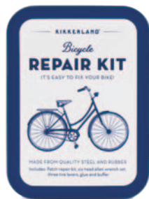
Bicycle Repair Kit by Kikkerland, at Welk's (page 34)