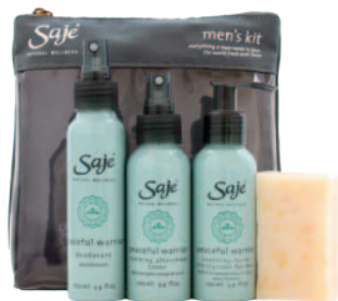
The Natural Men's Grooming Care Kit by Saje Natural Wellness (page 41)