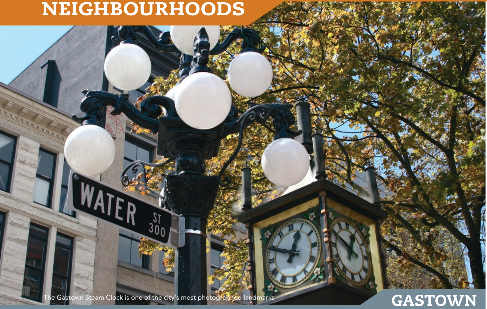
The Gastown Steam Clock is one of the city's most photographed landmarks