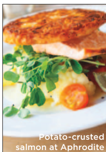
Potato-crusted salmon at Aphrodite