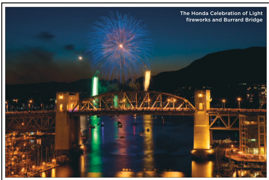
The Honda Celebration of Light fireworks and Burrard Bridge