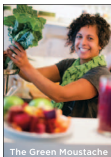
The Green Moustache