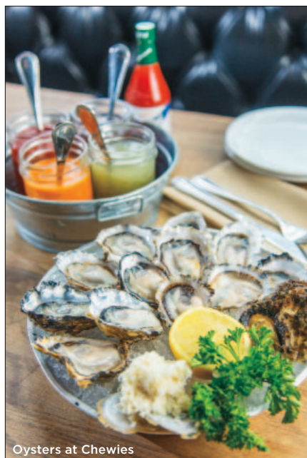
Oysters at Chewies