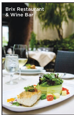
Brix Restaurant & Wine Bar