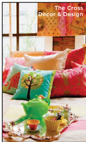
The Cross Decor & Design

The building dates back almost a century but the menu is modern, with a focus on Pacific Northwest ingredients, at 10 Brix Restaurant & Wine Bar (page 117). Ask for a seat on the heated, glass-covered, courtyard patio while you peruse the extensive wine list. If cocktails and martinis are more to your taste, head next door to 11 Shakin' Not Stirred (page 110). W