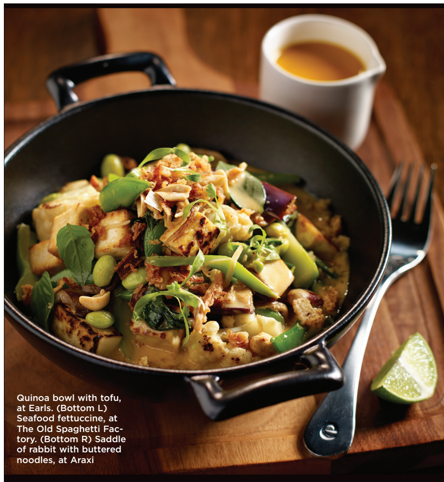
Quinoa bowl with tofu, at Earls. (Bottom L) Seafood fettuccine, at The Old Spaghetti Factory. (Bottom R) Saddle of rabbit with buttered noodles, at Araxi