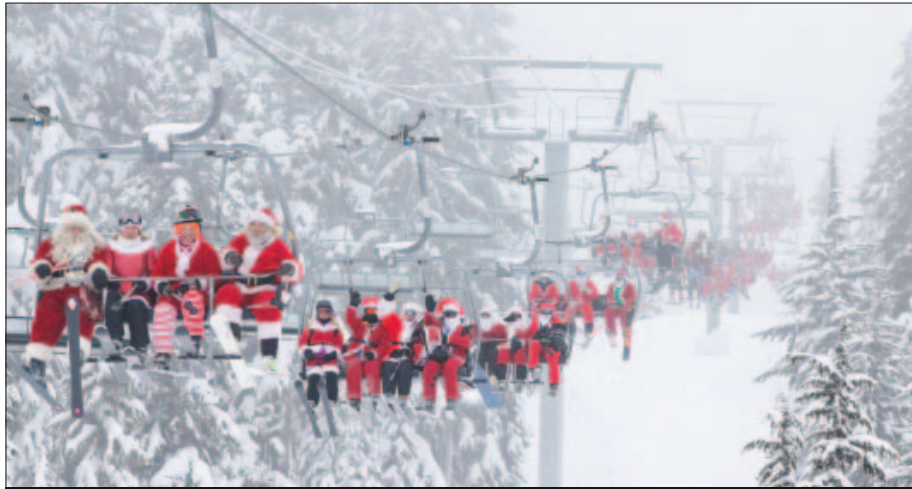
Dress Like Santa Day