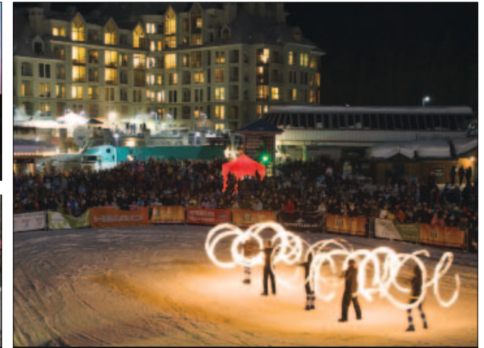
Fire and Ice Show