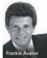
PHOTO: FRANKIE AVALON

5 Frankie Avalon and Bobby Rydell make you remember the teen idols they once were, at the Red Robinson Show Theatre (May 26; page 96).