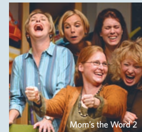
PHOTO: MOM'S THE WORD 2

His latest, The Andersen Project intertwines past and present in a modern-day fairy tale (May 3 to 27, Vancouver Playhouse; page 98). The four mothers in Mom's the Word 2: Unhinged have probably read more than their share of fairy tales, but none of the moms could be accused of living in one. In fact, coping with teenagers—the topic of this high-energy show—is more akin to a nightmare than a bedtime story (to Jun. 9, Arts Club Granville Island Stage; page 98). W