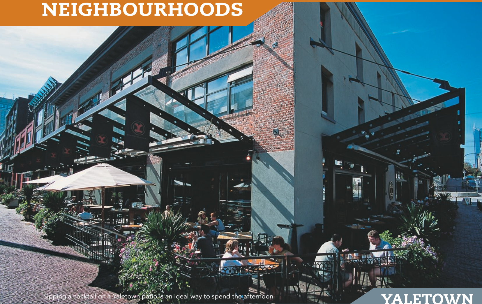
Sipping a cocktail on a Yaletown patio is an ideal way to spend the afternoon